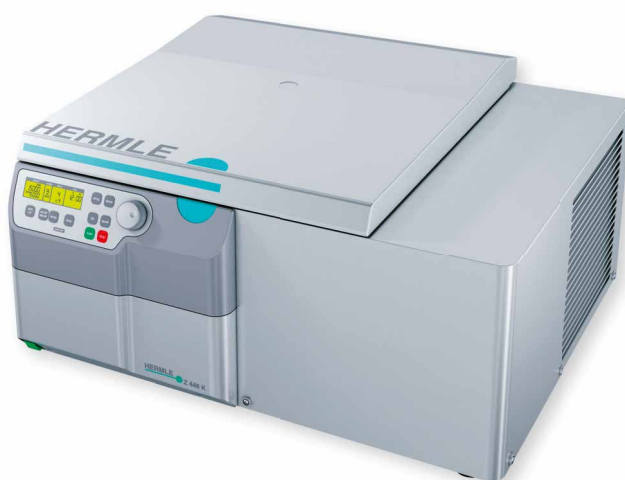
Universal High Speed Centrifuge Z 446 K

Max. Speed: 6,800 rpm Max. Volume: 8 x 15 ml