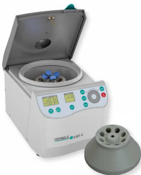
Compact Centrifuge Z 207 A

Max. Speed: 6,800 rpm Max. Volume: 8 x 15 ml